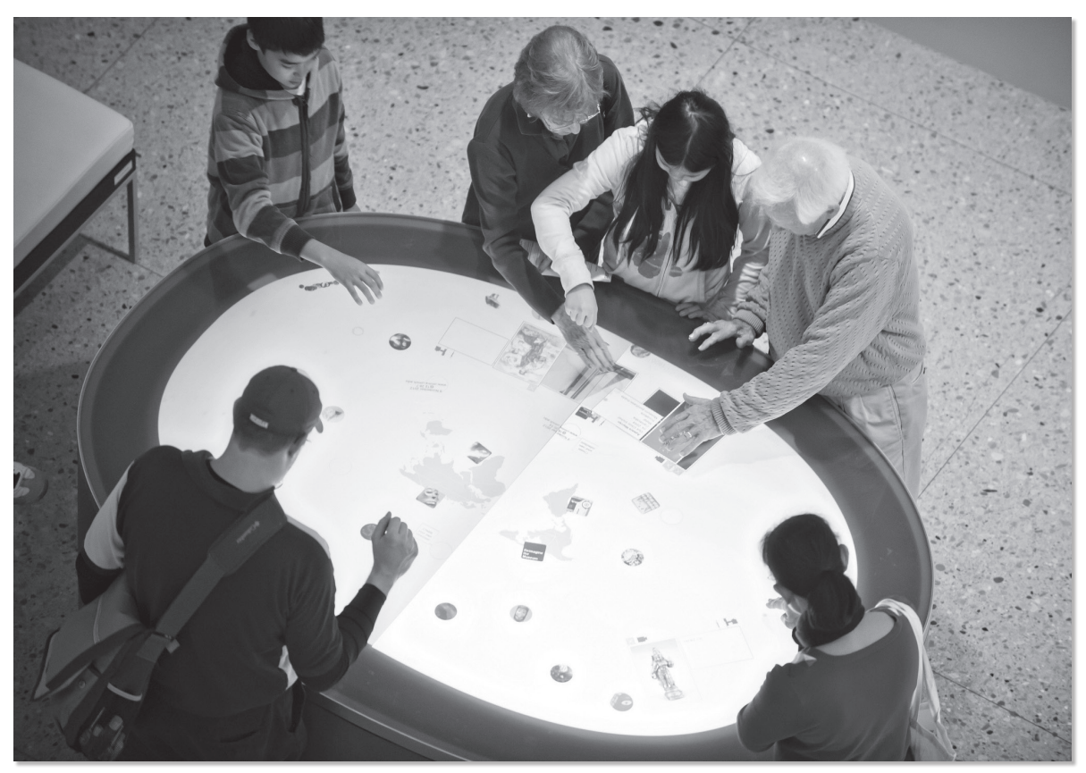
The DialogTable uses gesture-based technology to allow visitors to learn collectively and share their reflections about artworks in the University of Michigan's Museum of Art.